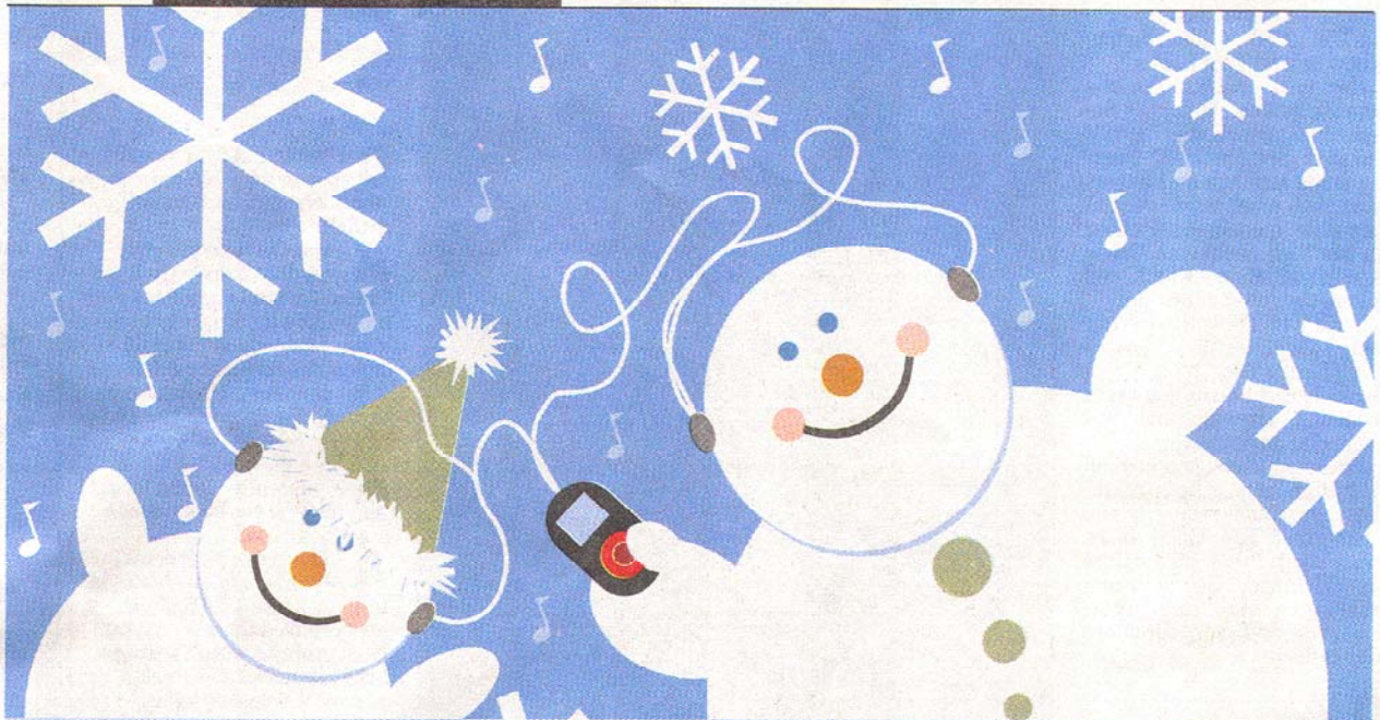
BRIAN A. GRIFFIN — MERCURY NEWS ILLUSTRATION